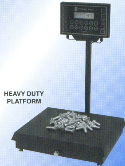
HEAVY DUTY PLATFORM