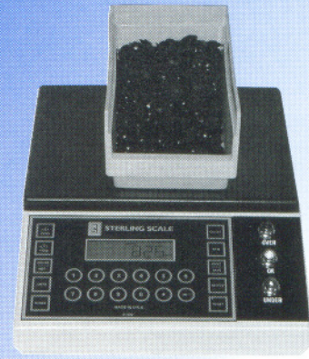
MODEL 825 CHECKWEIGH OPTION GREEN LAMP = OK RED LAMP = OVER AMBER LAMP = UNDER